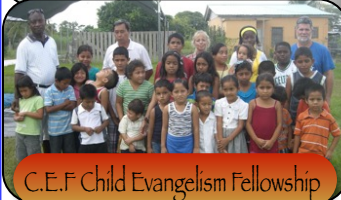
C.E.F Child Evangelism Fellowship

Three years we worked in this church. We taught Sunday school, led worship, preached, taught group Bible studies, youth retreats, & C.E.F