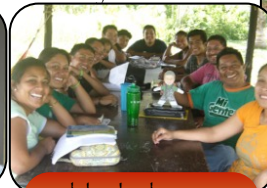
Youth leadership seminar