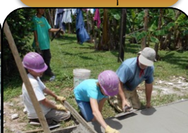
Youth mission team

We left good friends and people we are praying will eventually give their lives to the Lord. We also pray the Christians we were working with will submit their wills to the will of the Lord and enjoy His true joy on earth. What's next..... we don't really know yet. Only the Lord knows what He has for us. We are convinced He has been working in our lives to His greater glory, and has been preparing us for the ministry He is going to reveal.