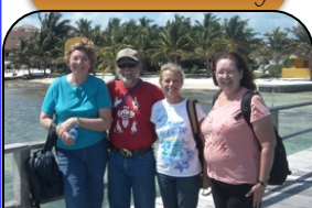
Adult sewing team

We may have left Belize with our bodies, but we left a lot of ourselves behind. We put our heart and soul into the lives and work the Lord called us to.