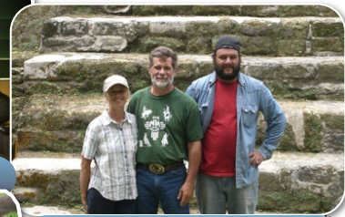
Taking some time to enjoy the sights of Belize at Lamanai, Mayan ruins. A fantastic boat ride, complete with a local visitor, who came aboard looking for some bananas.