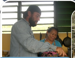
Helping in the kitchen