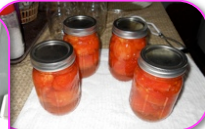
beautiful bumper crop and the equipment &

Thank you again "Community Church of Red Rock" for your gift to the ministry. We are truly blessed to have you praying and supporting us in the ministry here in Belize.